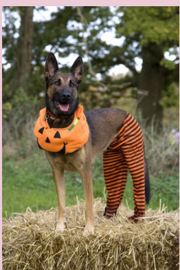
Astrid winner of the Fancy Dressed Dog at our October Fun Day