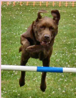
Paddy in action at Agility & try-outs at the fun day.